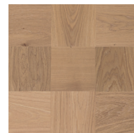
Noble Oak Soho