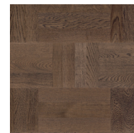
Noble Oak Wasa