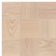
Noble Oak Brooklyn