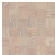
Noble Oak Manhattan