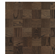
Noble Oak Chelsea