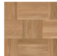
Noble Oak Classic