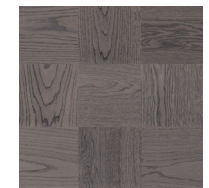
Noble Oak Bronx

The pictures only present the colour of the floor. For more details regarding grading and variations see the Grading Book or www.tarkett.com . Tarkett's international range of floors comprises many different products. Some of these may not be for sale in your country. Although every care has been taken to reproduce images that reflect the finished product, the quality of monitor and printer and the nature of wood results in variations in the color and structure of individual planks. When sanding a wooden floor the appearance will change in colour, texture and surface effects.