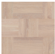
Noble Oak Scandinavia